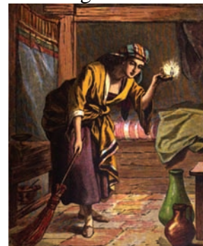
Parable of the Lost Coin

Join Creation Care Ministry and Development and Peace for a 15-minute Season of Creation parish prayer service right after the 5:30 pm mass next Saturday Sept. 17 th . All are welcome! The ecumenical Season of Creation runs from September 1 st to October 4 th and calls Christians around the world to pray and care for creation. Visit Creation Care Ministry's website at www.bit.ly/sjaccm to find suggestions for prayer, reflection and action, including a link to Pope Francis' message.